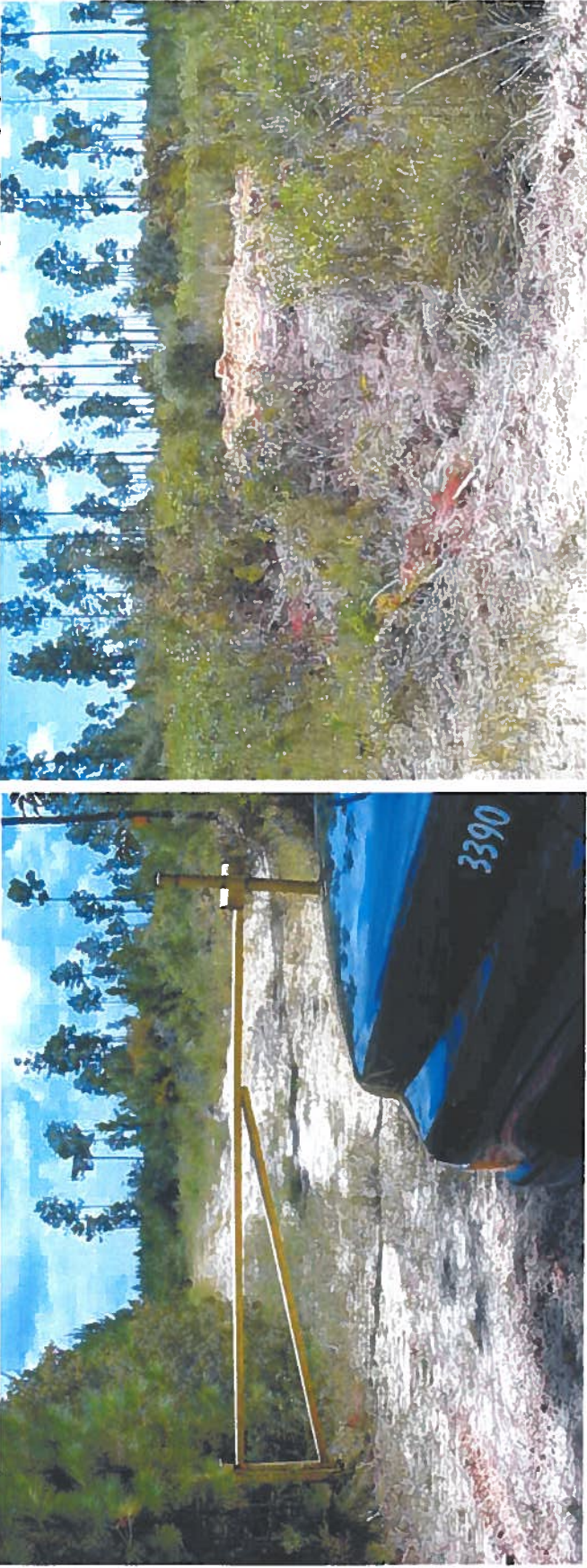
View of proposed pit area at west boundary on woods road, looking east. Area is quite flat, and recently lumbered. No mining had begun.